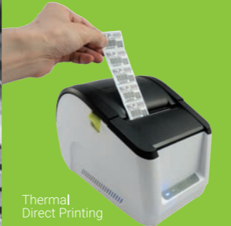
Thermal Direct Printing