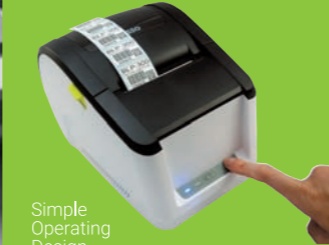
Simple Operating Design